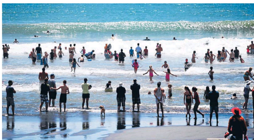
The beach is Oakura's primary attraction, but there's much more to enjoy here.