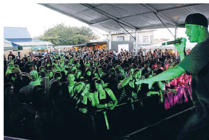
Live entertainment in the township adds a social buzz to a visit.